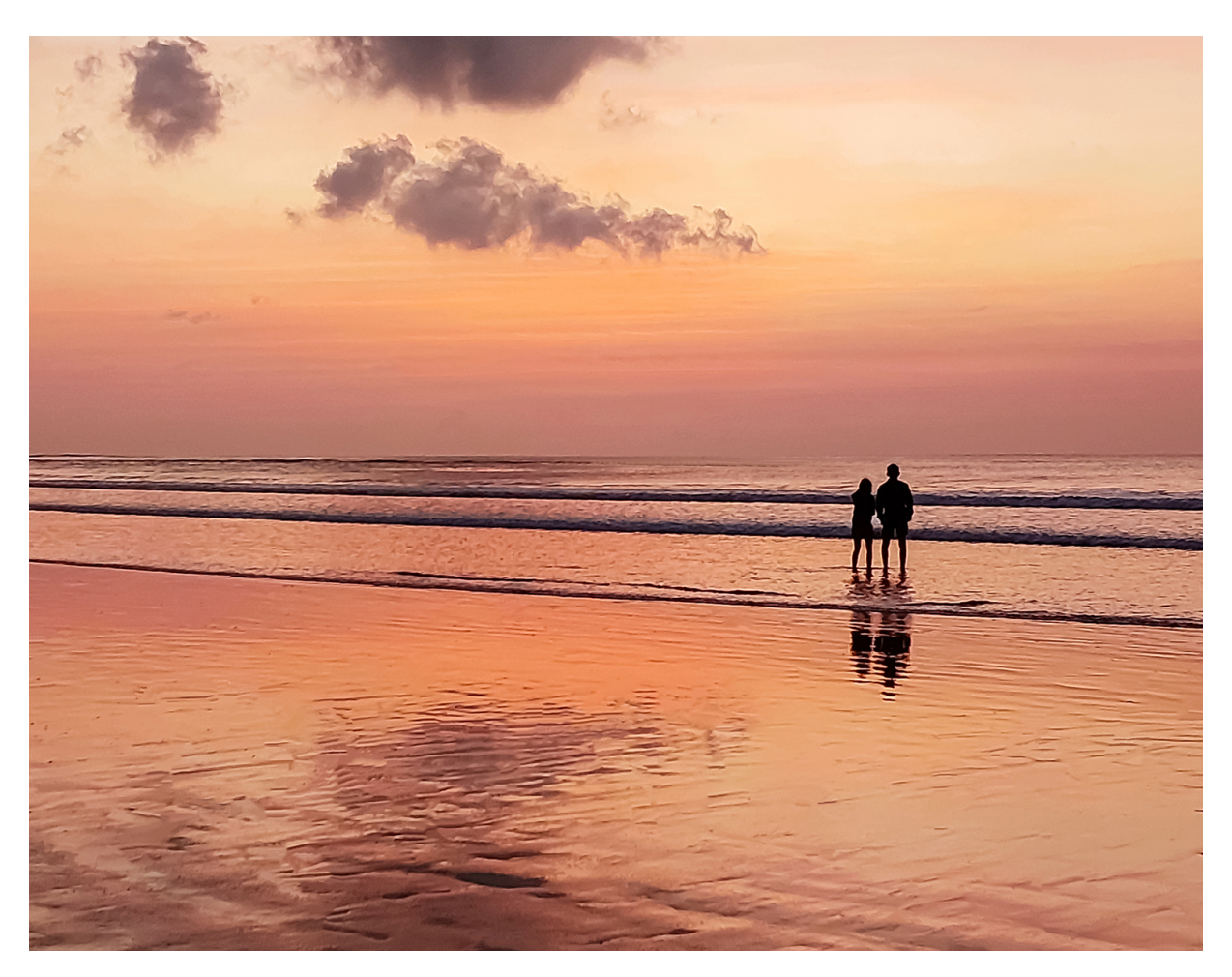
Admire The Sunset Best In Section Clara Soedarmo