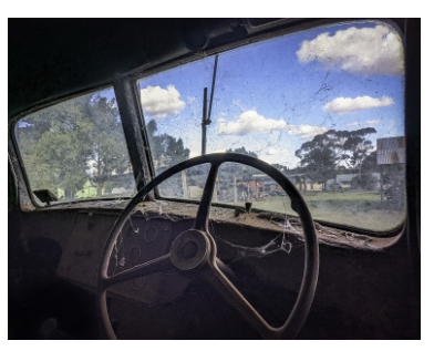
Parked Accepted Sandra Chapman