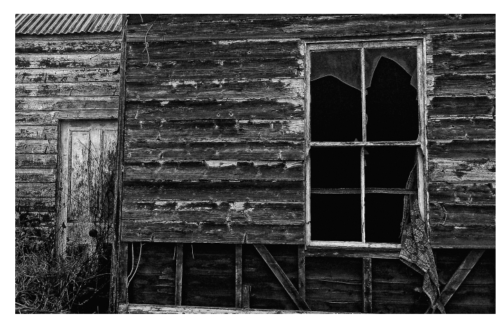
In Need Of TLC