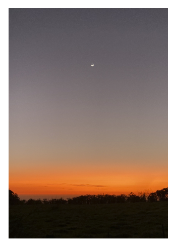
Sunrise Moonrise.