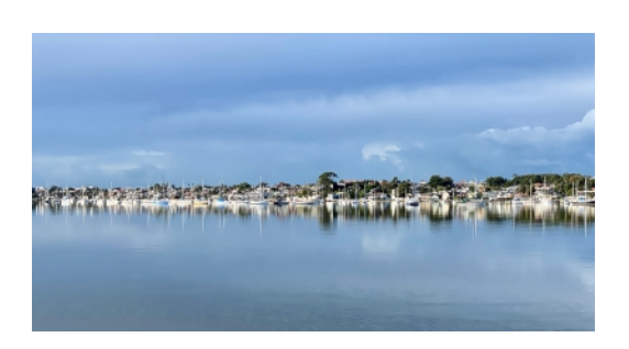
Boats Accepted Elaine Duncan