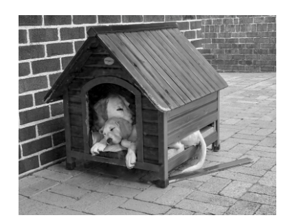
Crowded House Accepted Joe Cremona