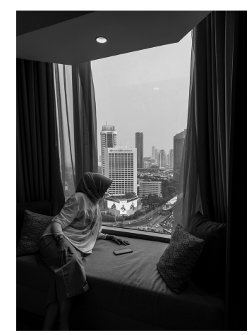
City by The Window