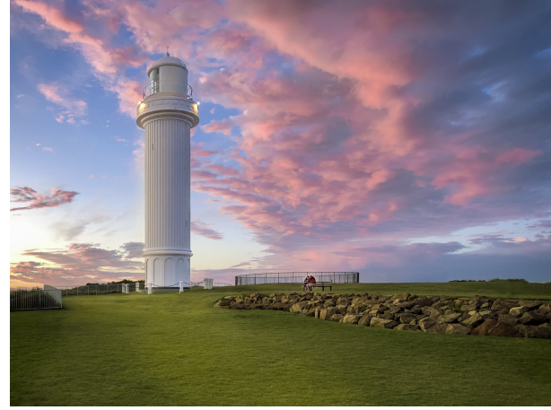
Sunrise At The Lighthouse