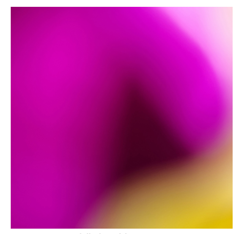
Violet Abstract