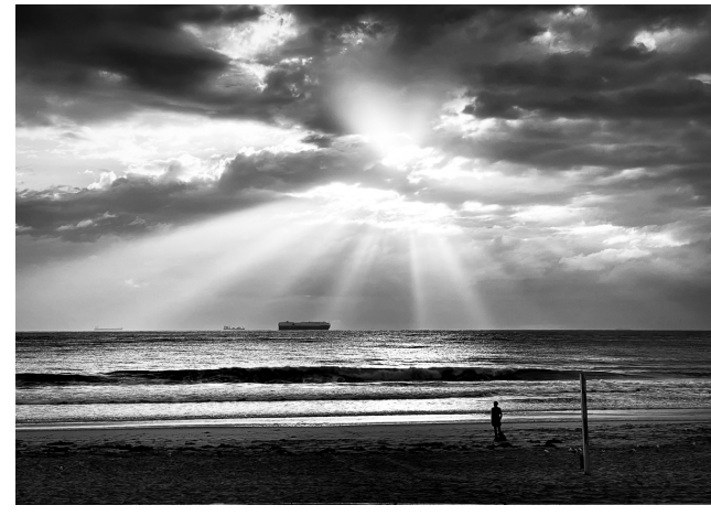
Good Morning Credit Elaine Duncan