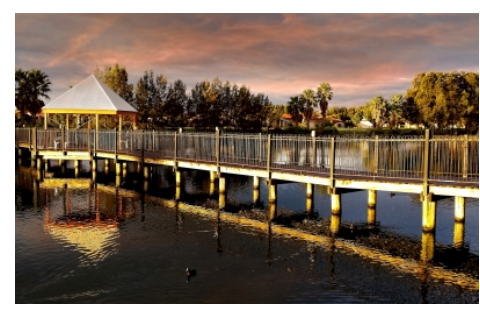
Afternoon At The Lake Accepted Bruce Shaw