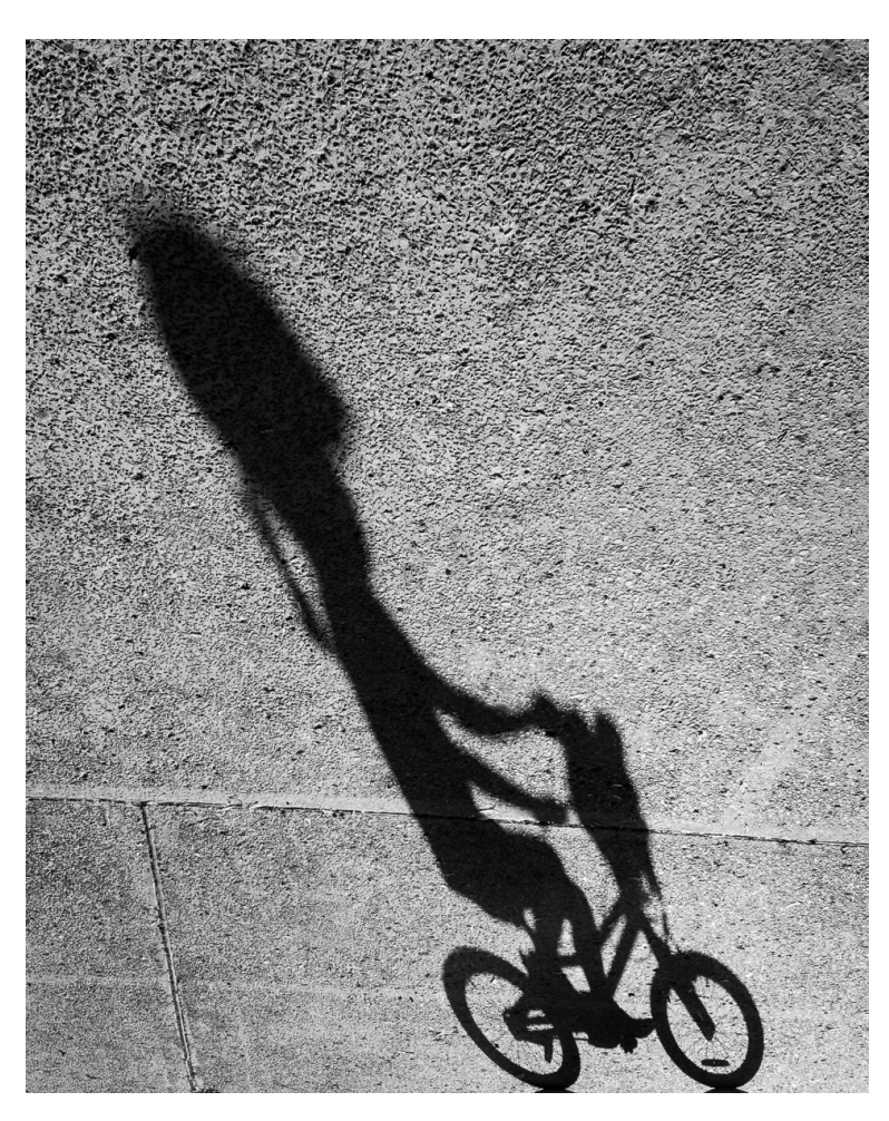
Shadow ride Best In Section Matt Dawson LAPS