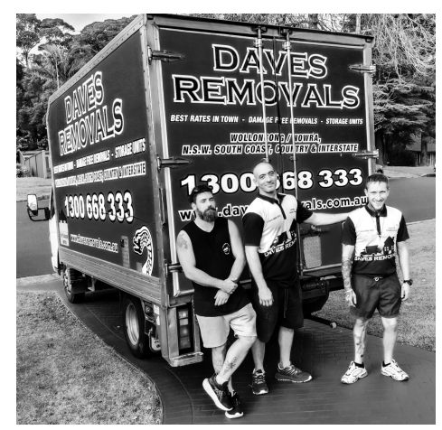
The Removalists - Oppo Phone