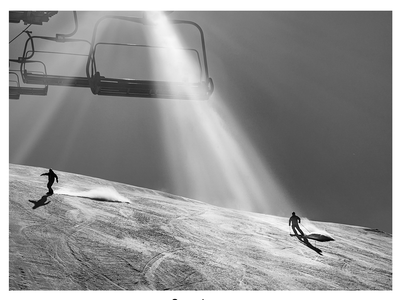
Snow beam Best In Section Sue Curtis