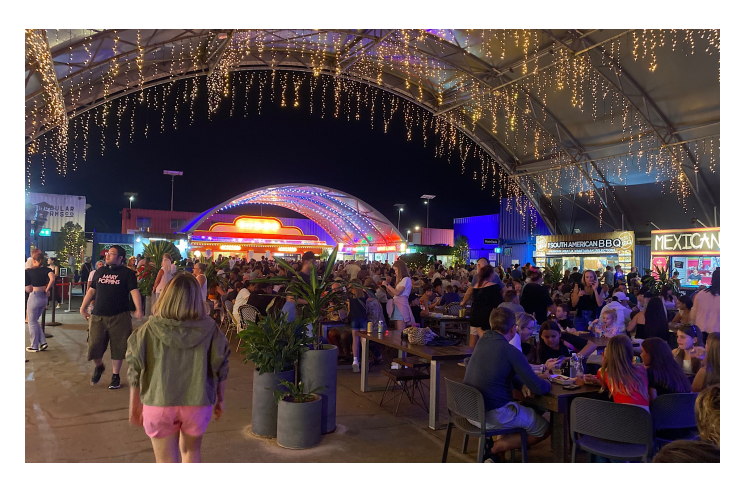
Find a empty table