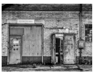
Open Door Accepted Tim Porteous