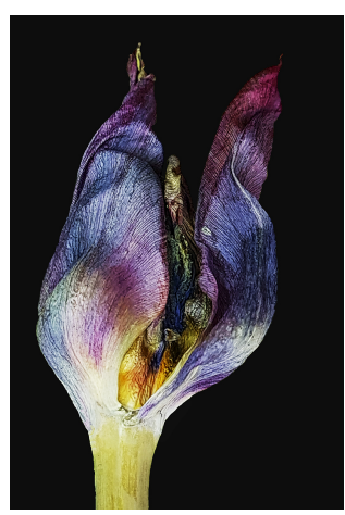
Dyeing Flower