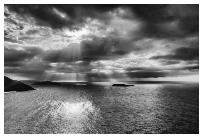
Sunbursts over Port Stephens