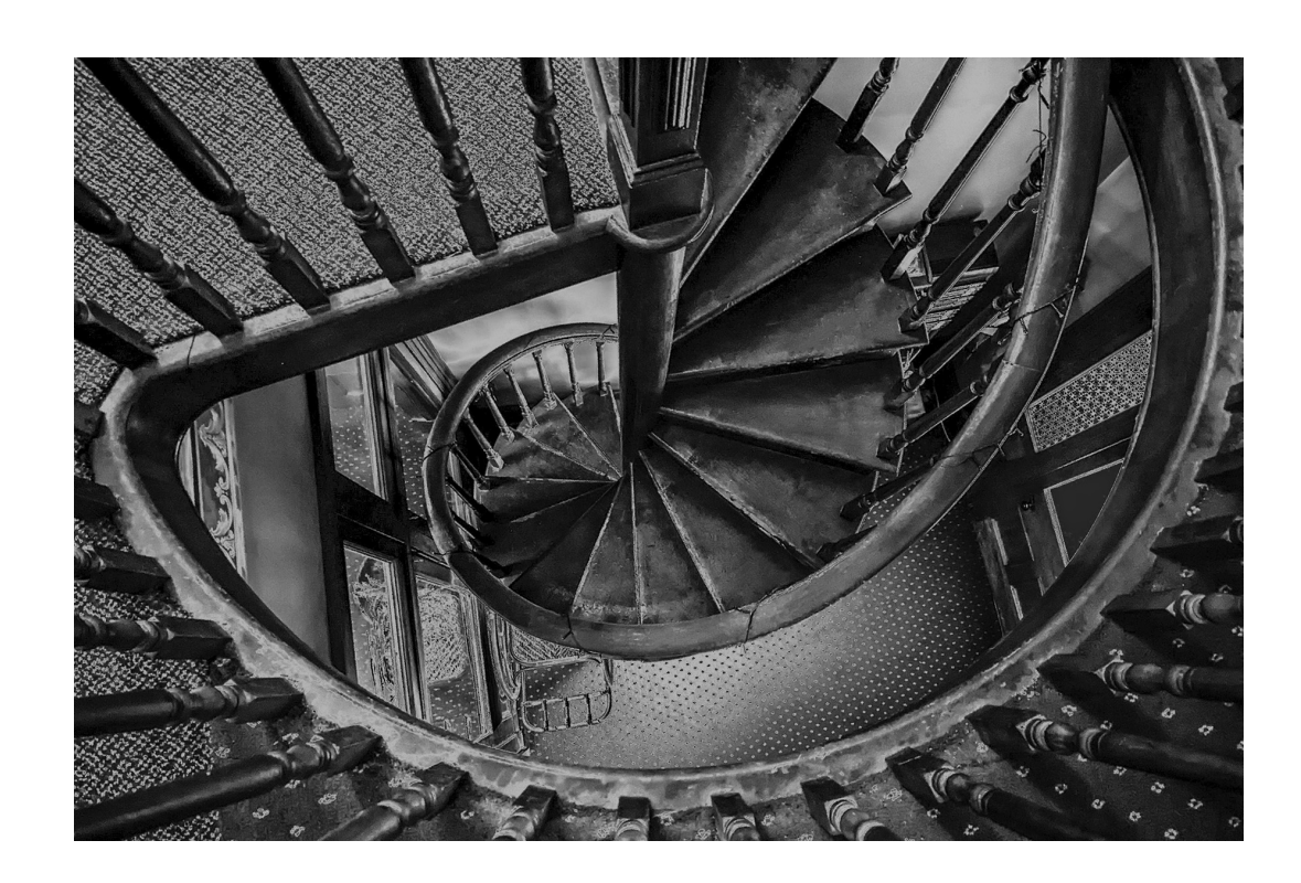
Downward spiral Merit Sandra Chapman