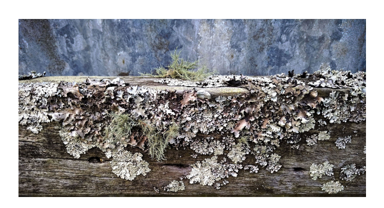
Lichen