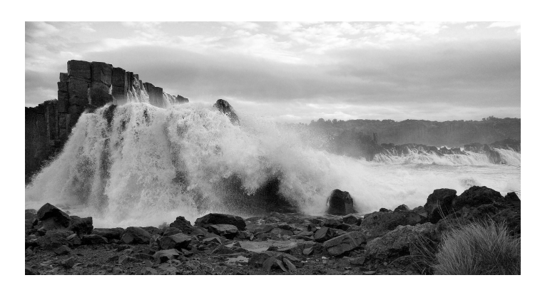
Wild and Wet Bombo